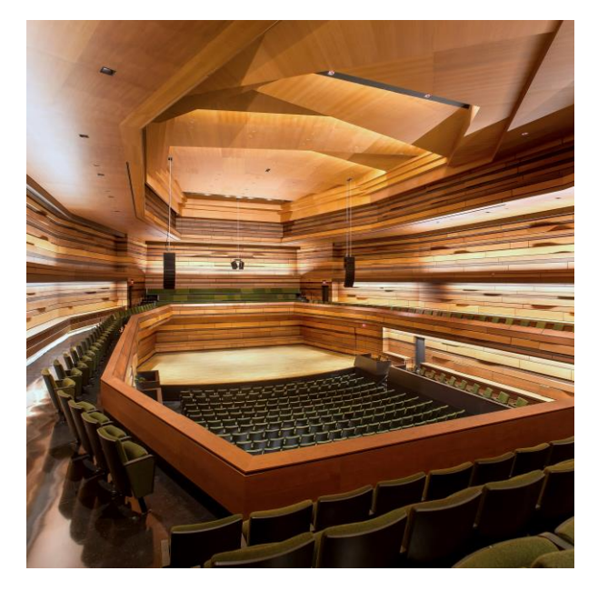
2 - Isabel Bader Centre for the Performing Arts